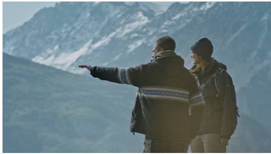
The documentary series Comment ça va le Nord?