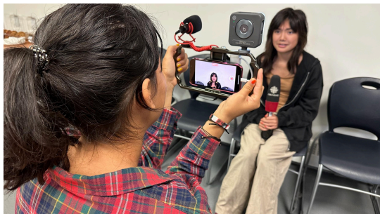
Media workshops were held by CBC North and the Yellowknife Public Library in three communities in the Northwest Territories