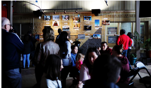
Community exhibit featuring work from a Collab photography and storytelling workshop in Happy Valley-Goose Bay