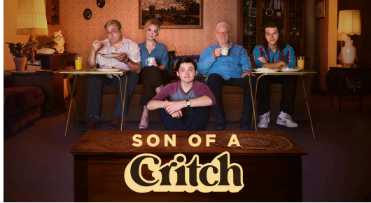
Son of a Critch , CBC's flagship TV production in the region is the most-watched Canadian comedy series in Canada