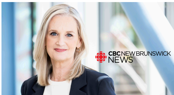
Clare MacKenzie, host of CBC New Brunswick News