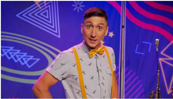
Radio-Canada's new kids' show, Zak : Dompteur de défis visited several New Brunswick communities including Dieppe, Shippagan and Caraquet