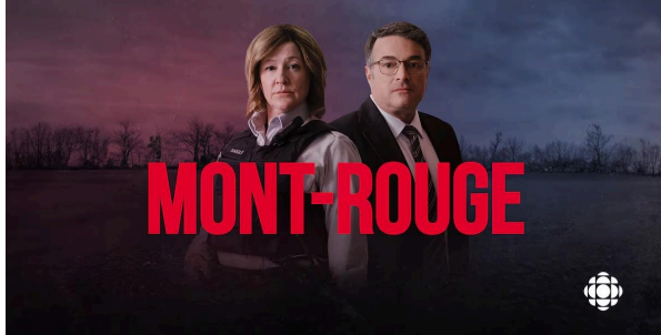
Mont-Rouge is shot in Shediac, Cocagne, Cap-Pelé and Moncton