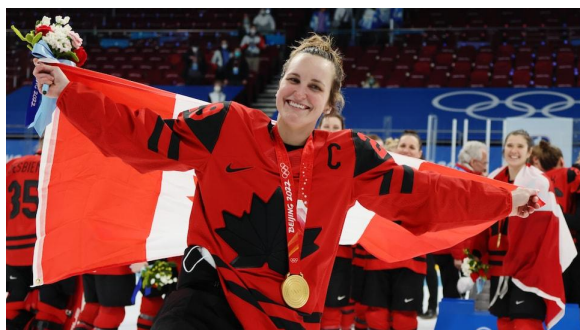
Northern Star award winner and women's hockey team captain, Marie-Philip Poulin, at Beijing 2022.